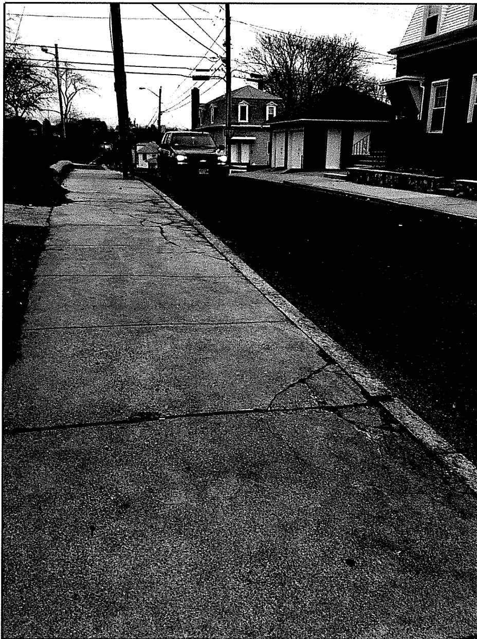
Photo shows more broken sidewalk panels on the west side of Adams between Mountain Ave. and Proctor